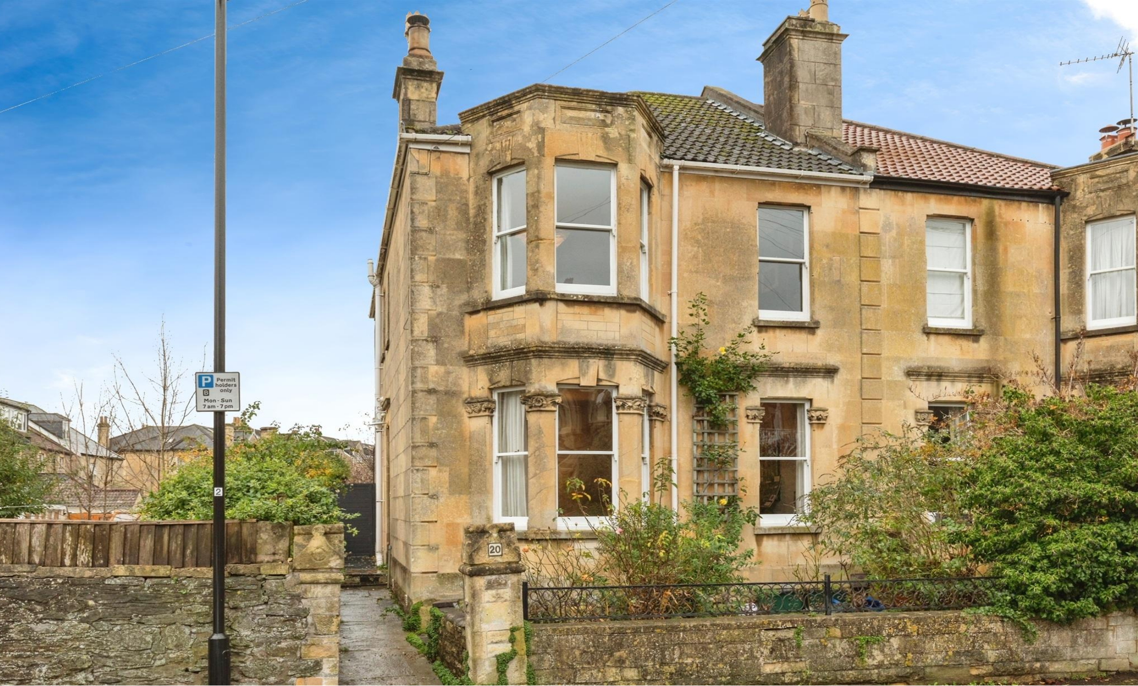
Evelyn Road, Bath BA1 3QF