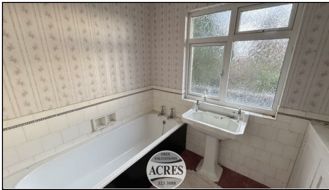
74 Hill Lane, Bassetts Pole, B75 6LF