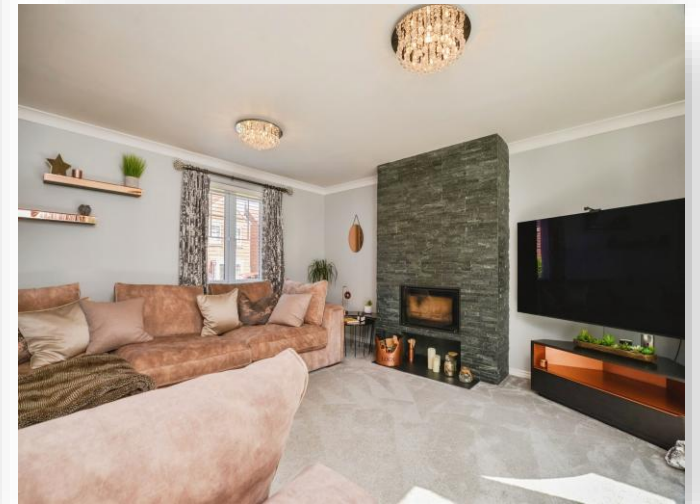
Crosswood Avenue, Middlesbrough TS6 0NL