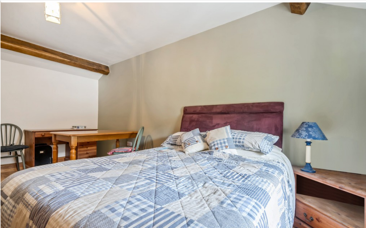
Farmhouse Bedroom Two