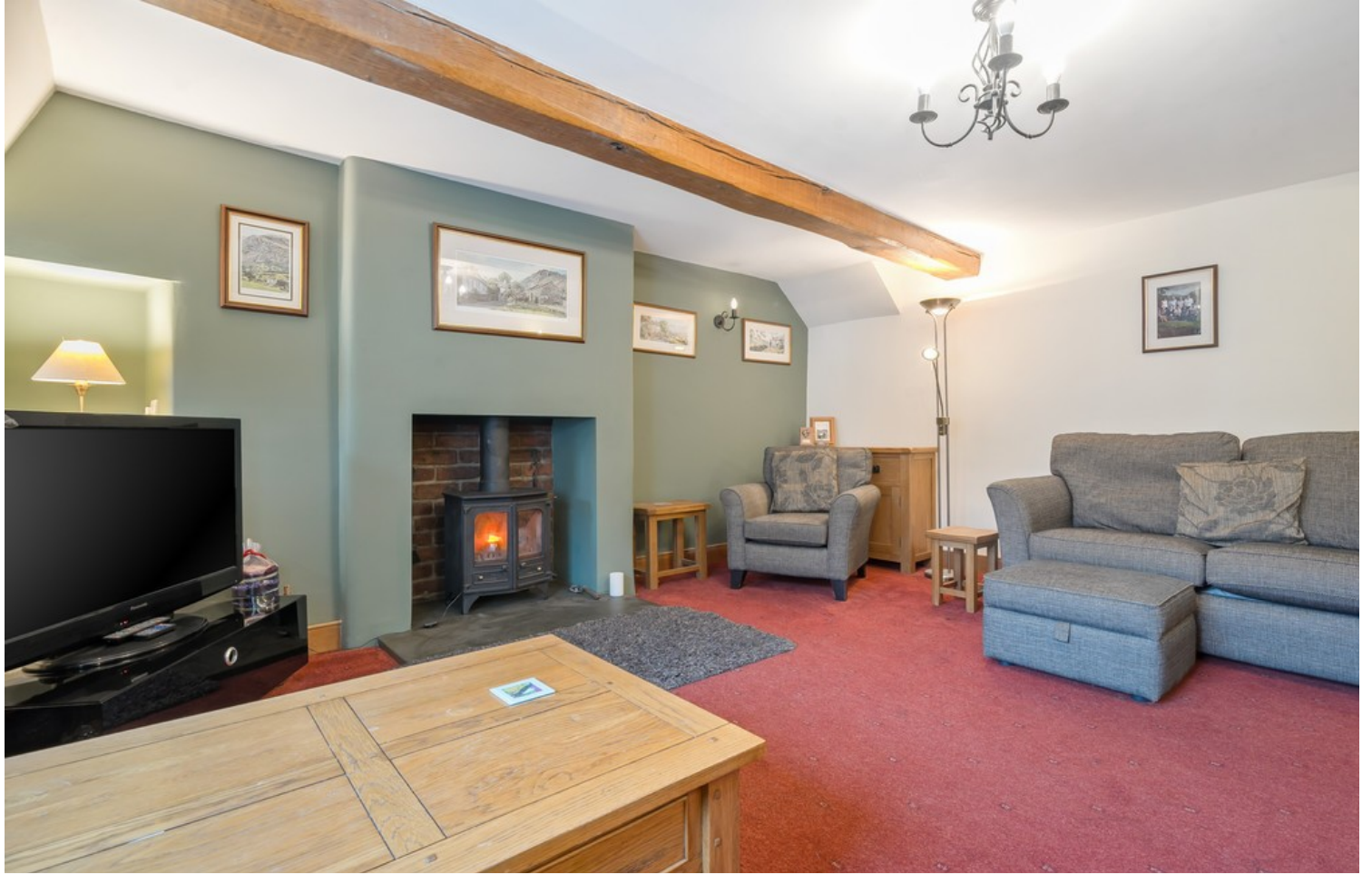
Farmhouse Living Room