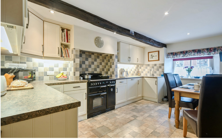
Farmhouse Dining Kitchen