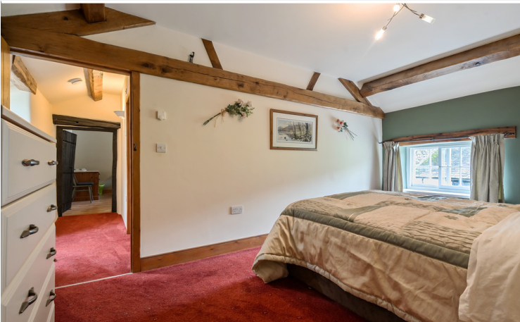
Farmhouse Bedroom One