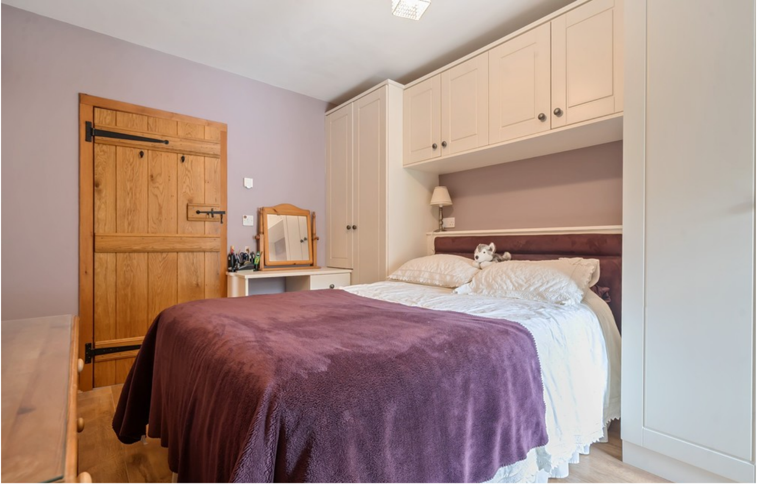
Farmhouse Bedroom Three