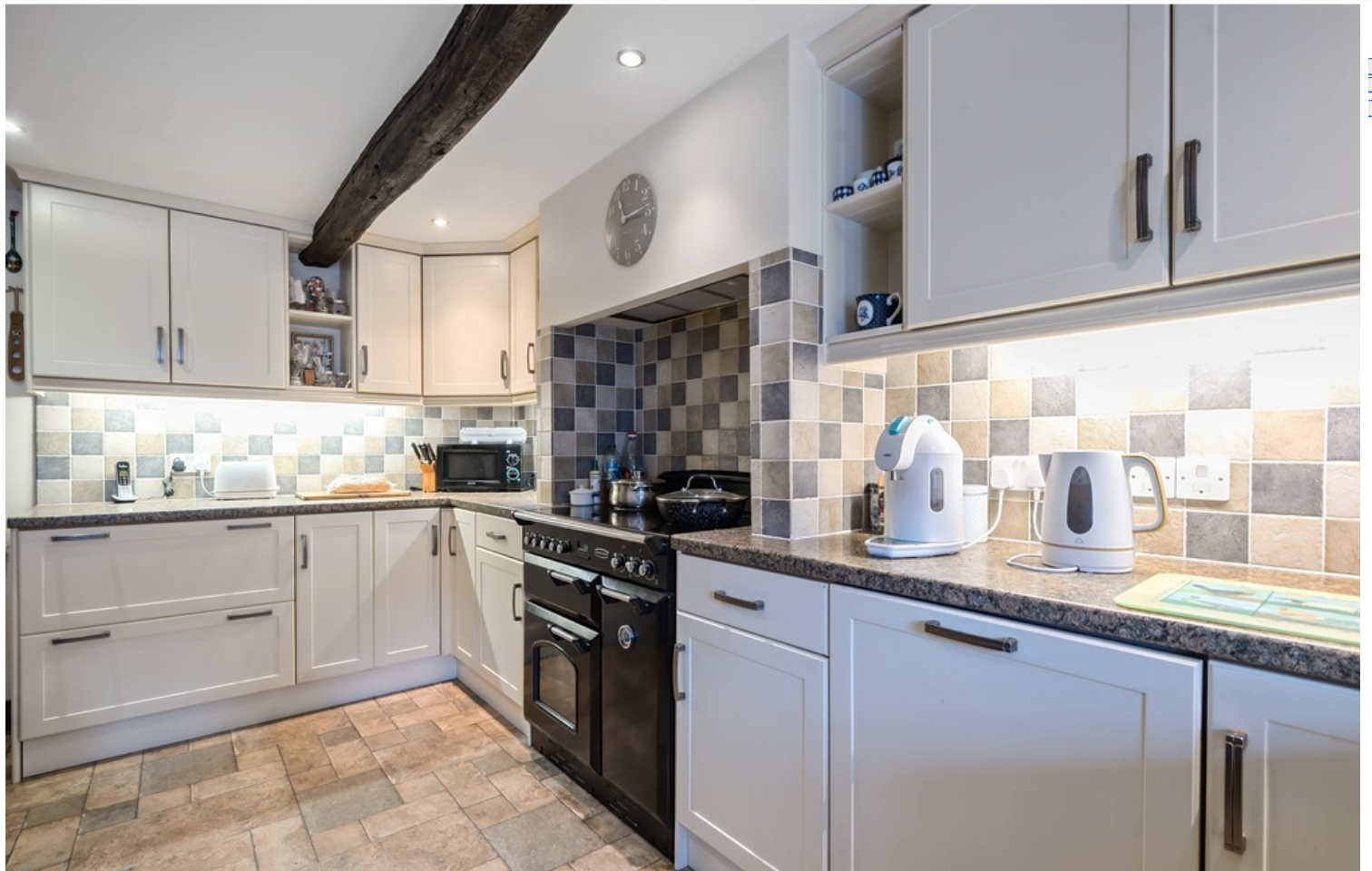
Farmhouse Dining Kitchen