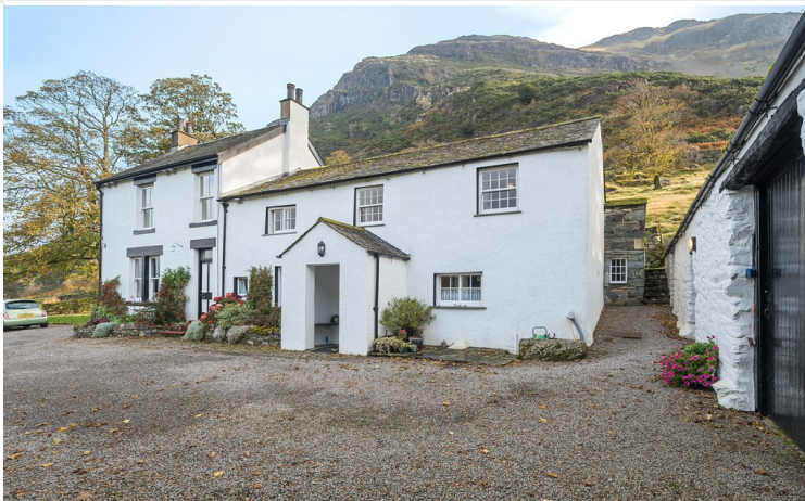
Farmhouse Front Elevation