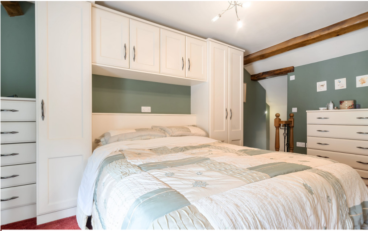
Farmhouse Bedroom One