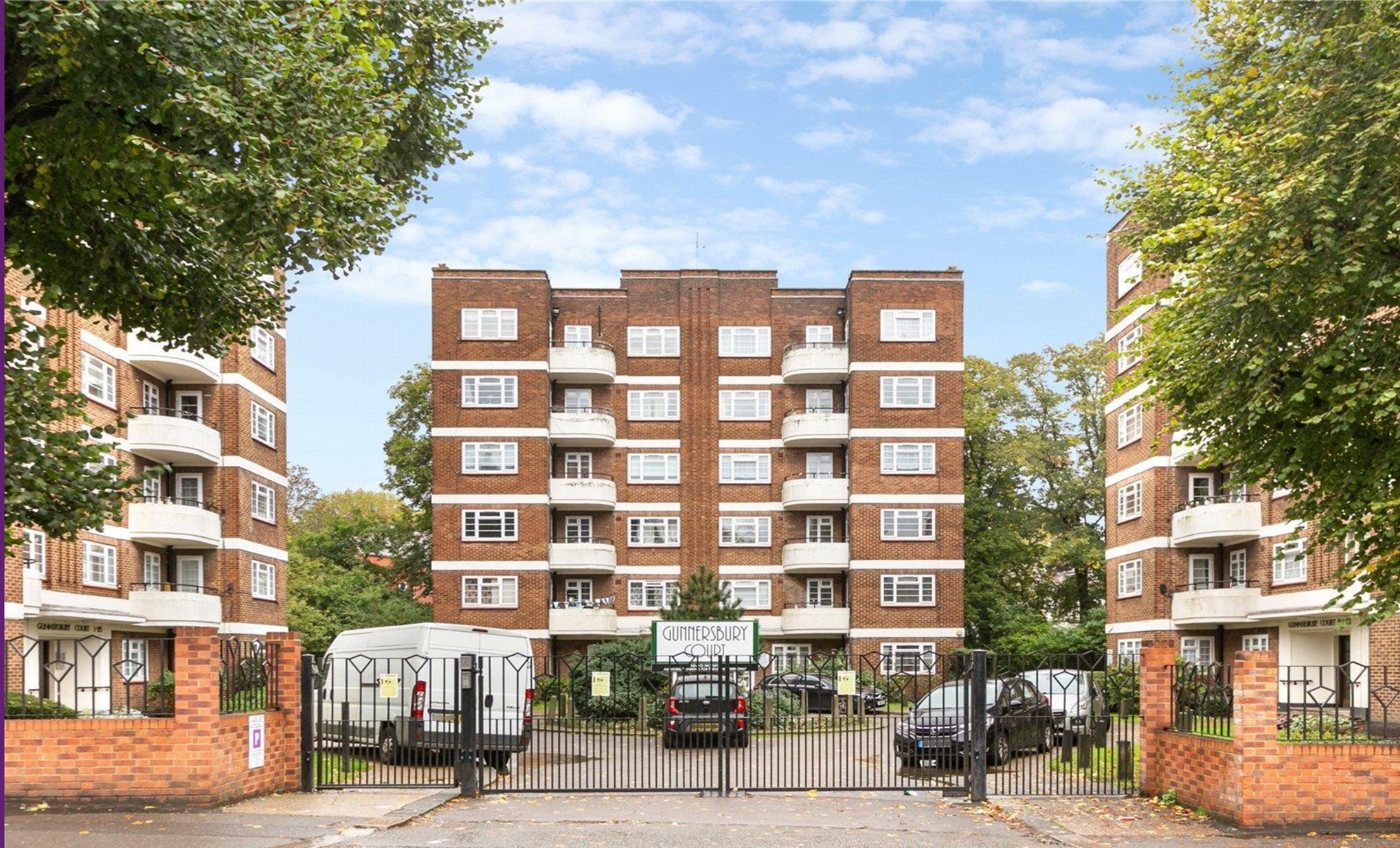
Gunnersbury Court Bollo Lane, W3