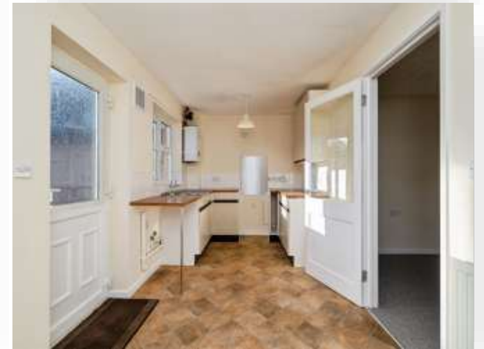
Tom Milford Place, Watton Thetford IP25 6UN