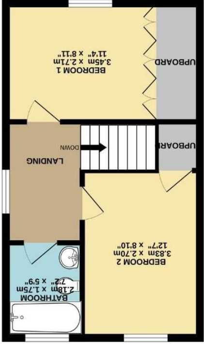
1ST FLOOR 34.0 sq.m. (366 sq.ft.) approx.

Whilst every attempt has been made to ensure the accuracy of the description contained herein, measurements of doors, windows, corners and any other items are approximate and no responsibility is taken for any error, omission or mis-statement. This plan is for illustrative purposes only and should be used as such by any prospective purchaser. The services, systems and appliances shown have not been tested and no guarantee as to their operating or efficiency can be given. Made with Metropix 6.0.25