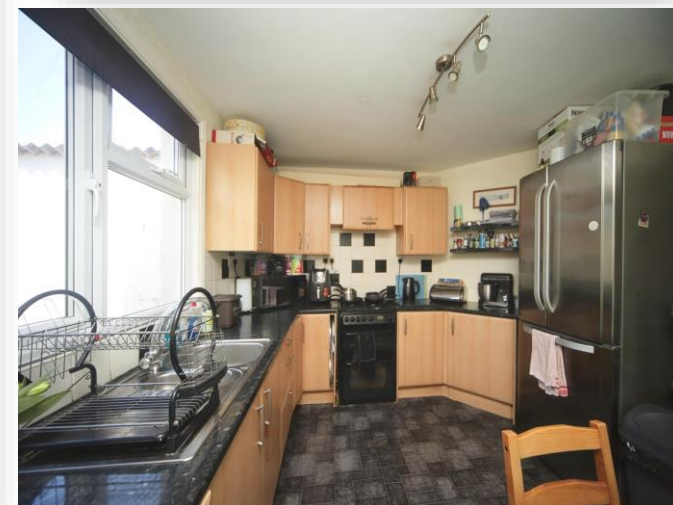
Lower Meadow Road, Minehead TA24 6AW