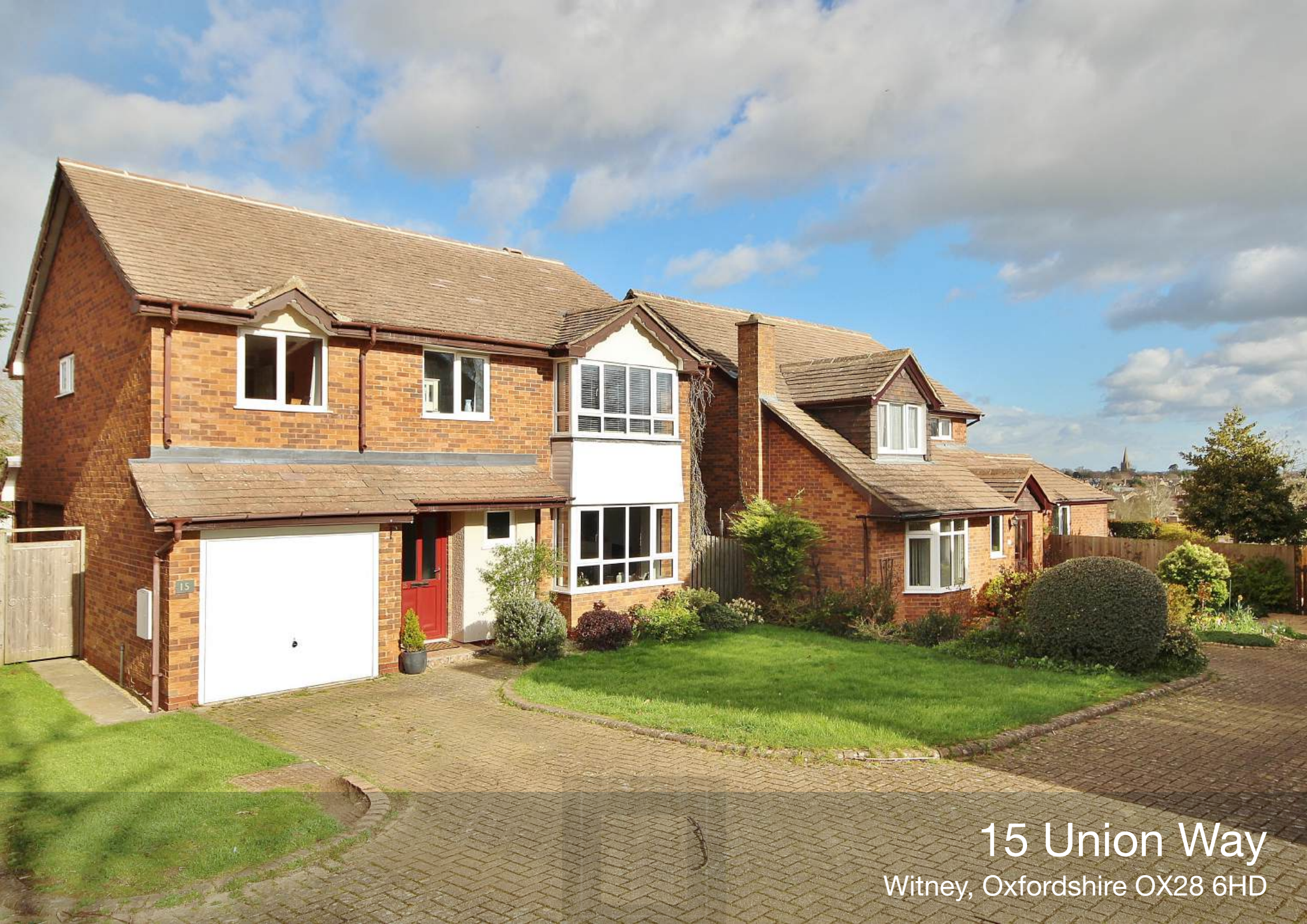
15 Union Way Witney, Oxfordshire OX28 6HD