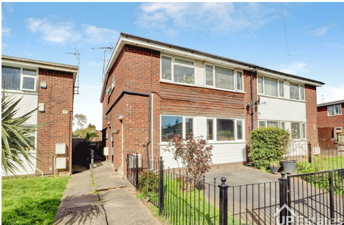
Vinecote Road, Longford, Coventry