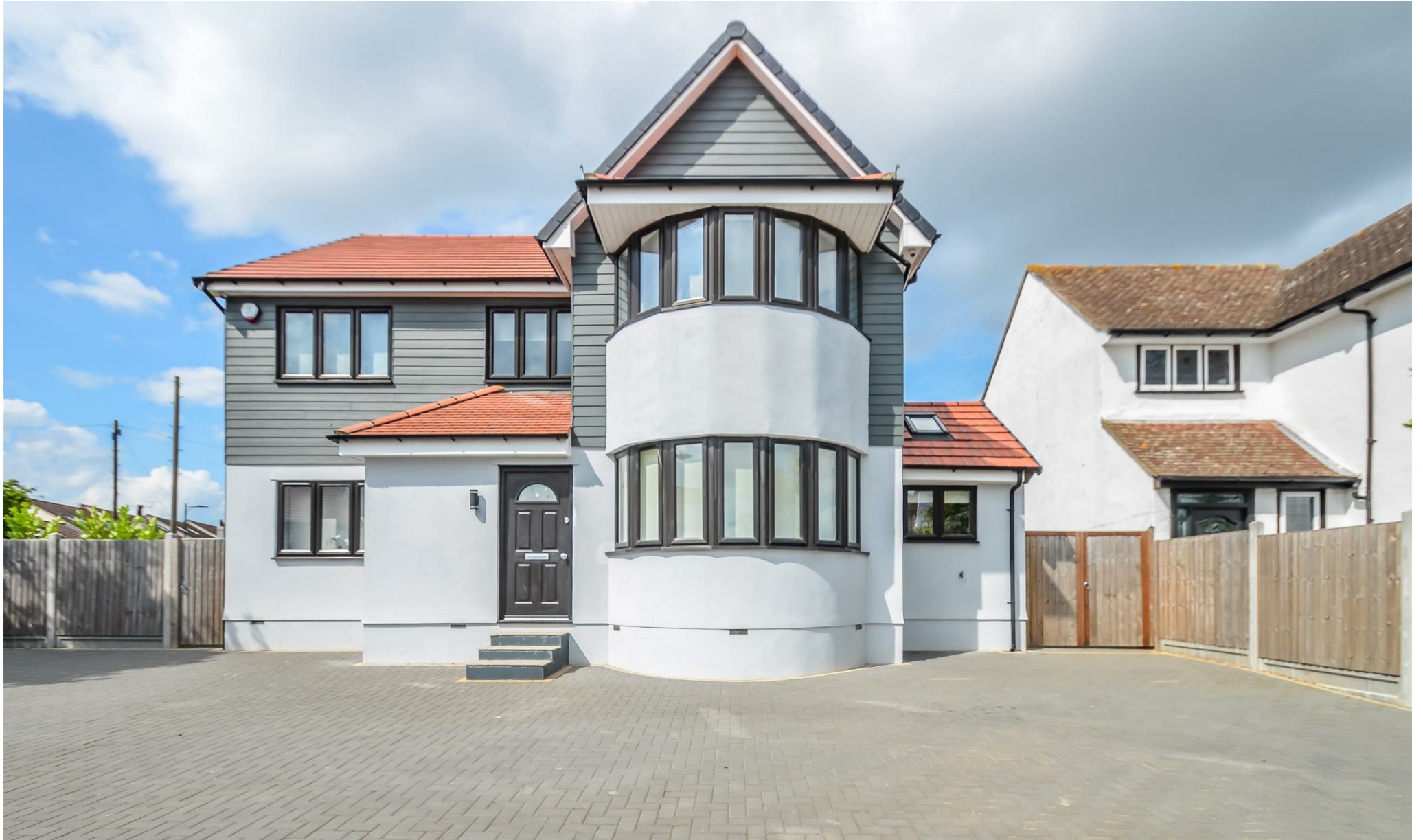
Western Road, Leigh £3,500 PCM