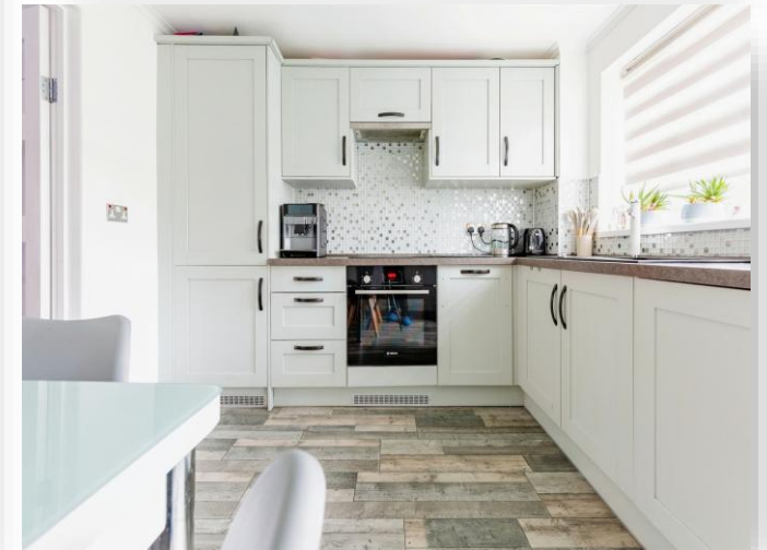
Bonham Court, Kettering NN16 8NJ