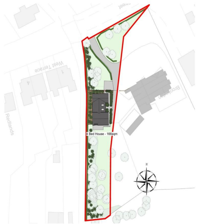
Proposed Block Plan 1 : 500