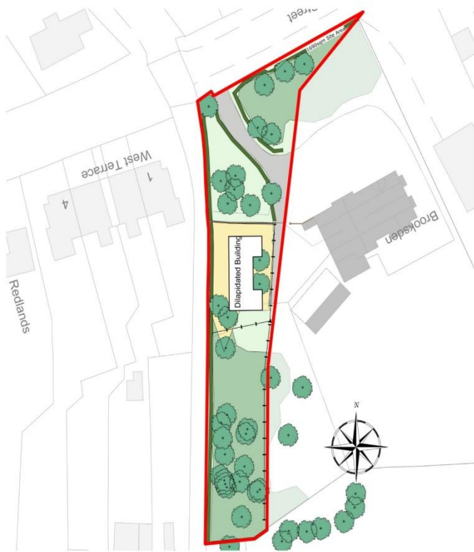
Existing Block Plan 1 : 500