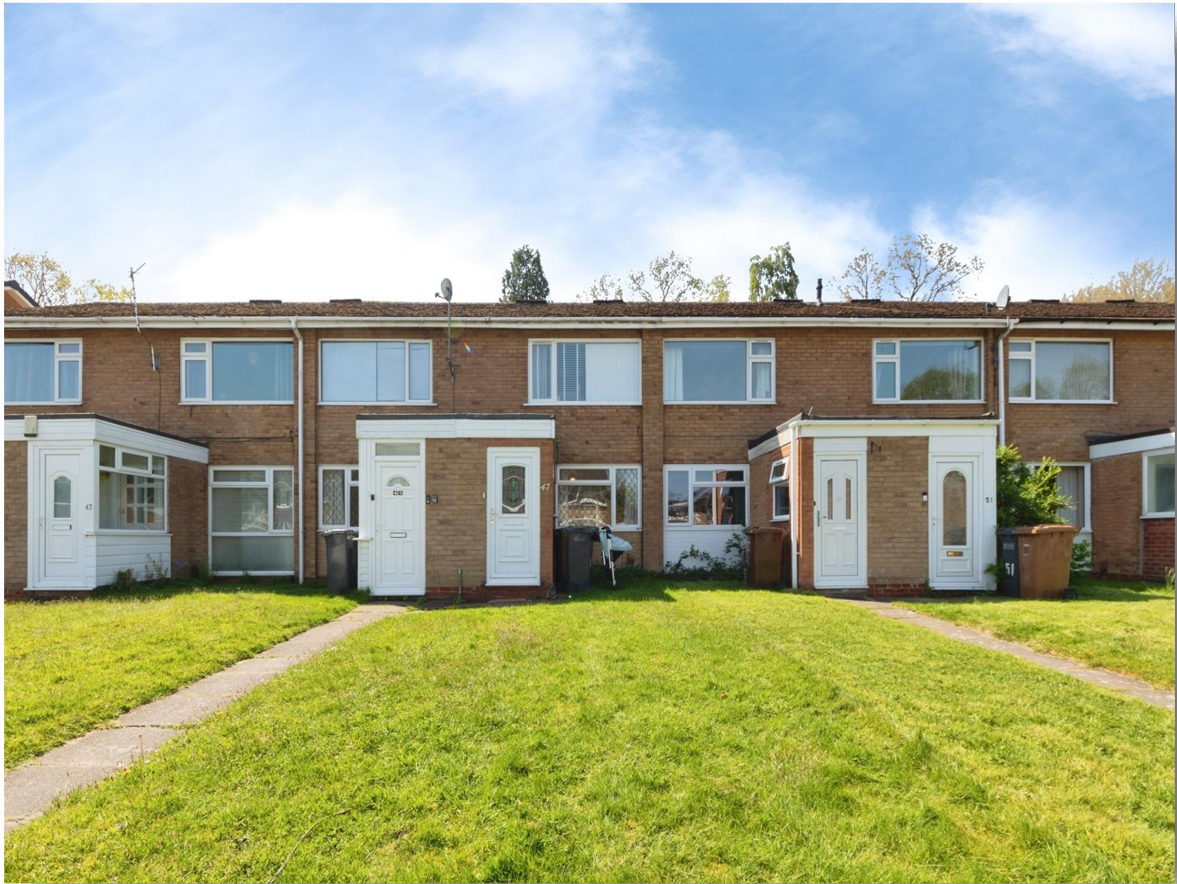
Draycote Close, Solihull B92 9PT