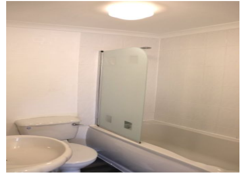
Coningsby Court, High Wycombe, HP13 5LJ