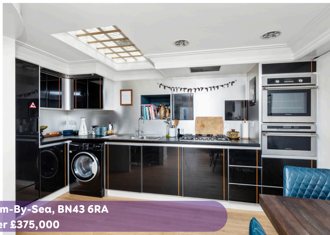
New Road, Shoreham-By-Sea, BN43 6RA Offers Over £375,000