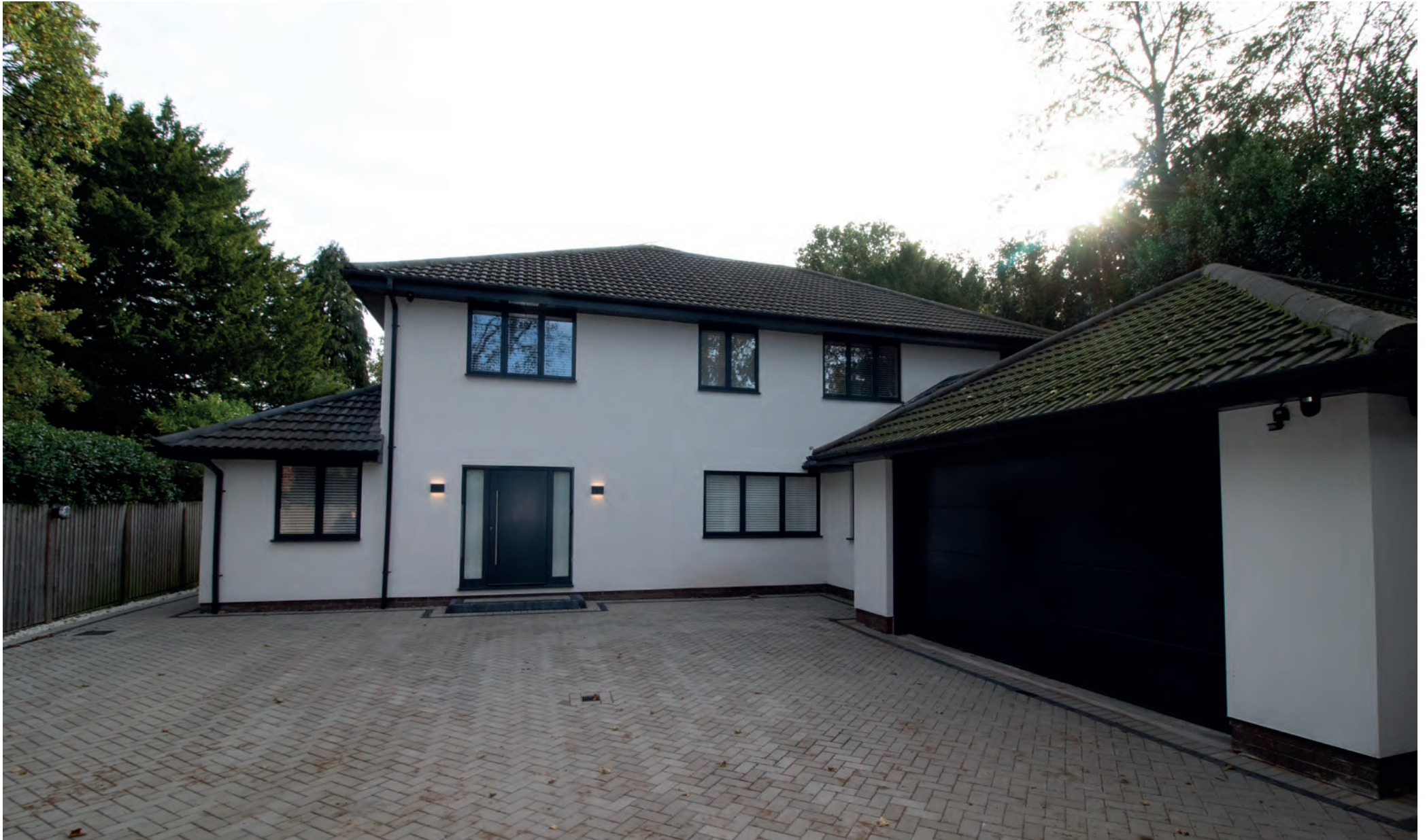
54 Weeping Cross Stafford | Staffordshire | ST17 0DL