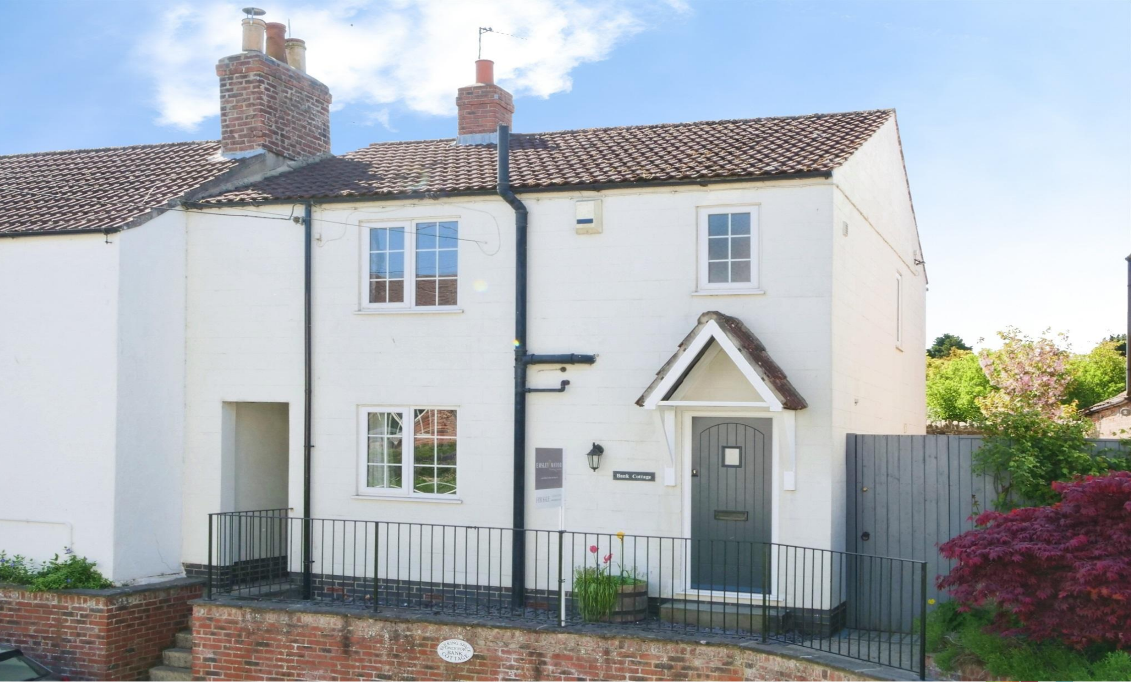
Bank Cottage Church End, Sheriff Hutton York YO60 6SY