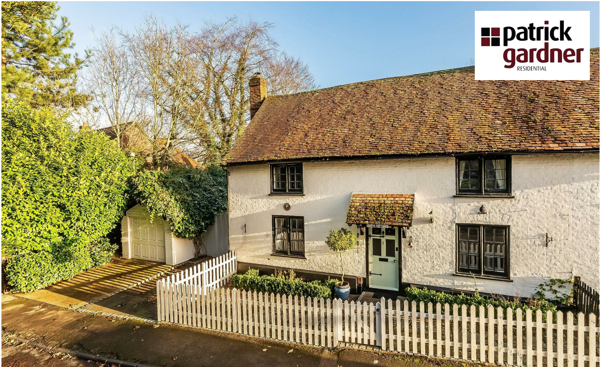
1 Grove Cottages Leatherhead Road, Great Bookham, Surrey, KT23 4NP