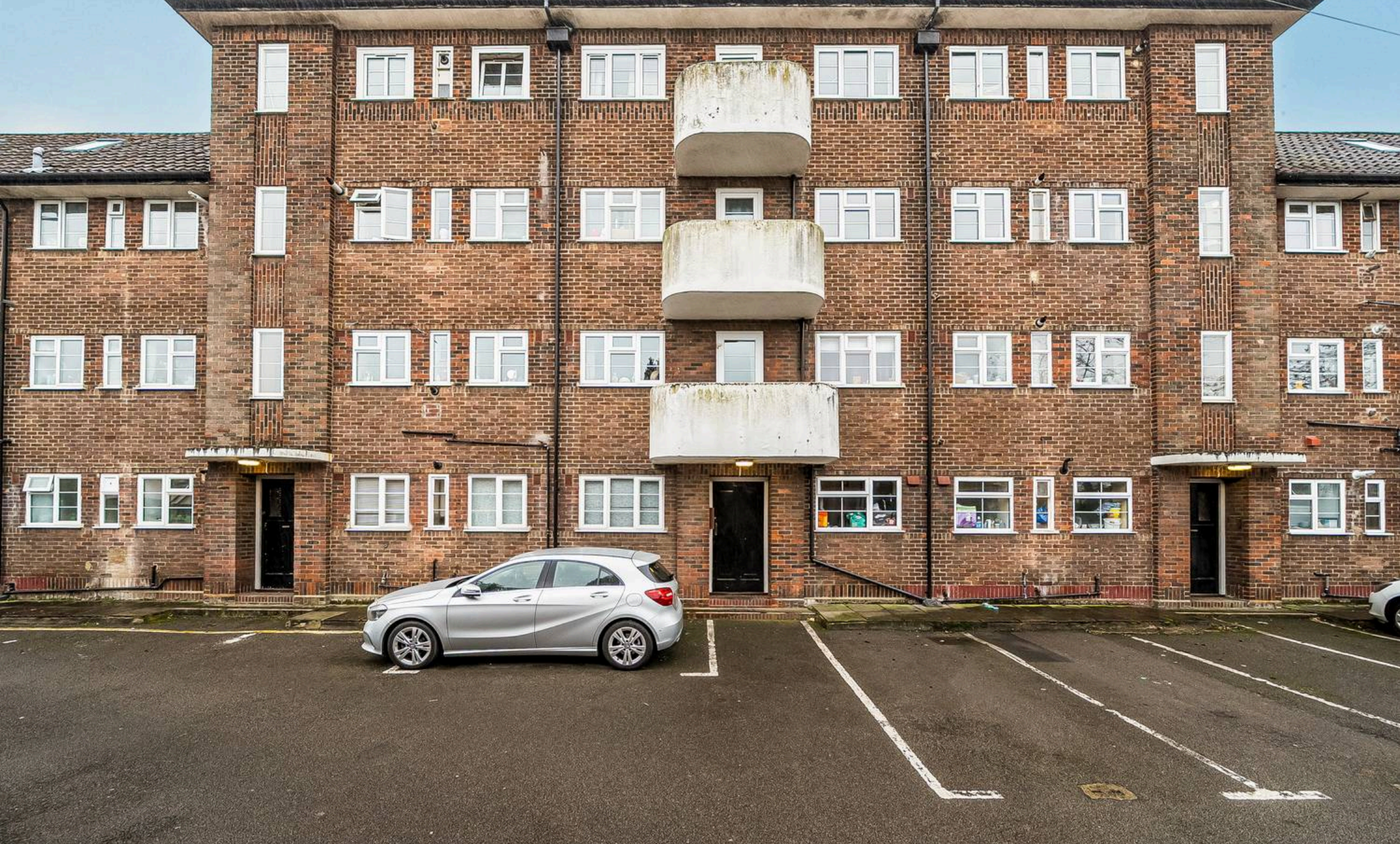
Court House Mansions, Eastway, Epsom