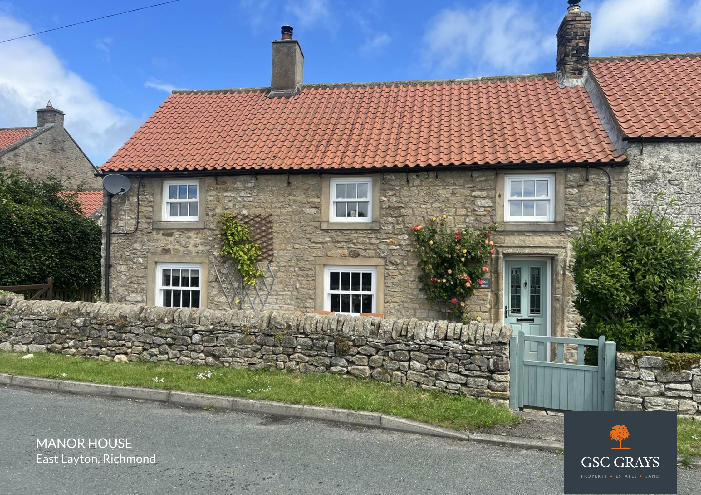
MANOR HOUSE East Layton, Richmond