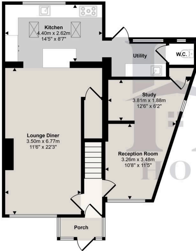
Ground Floor Approx 69 sq m / 744 sq ft