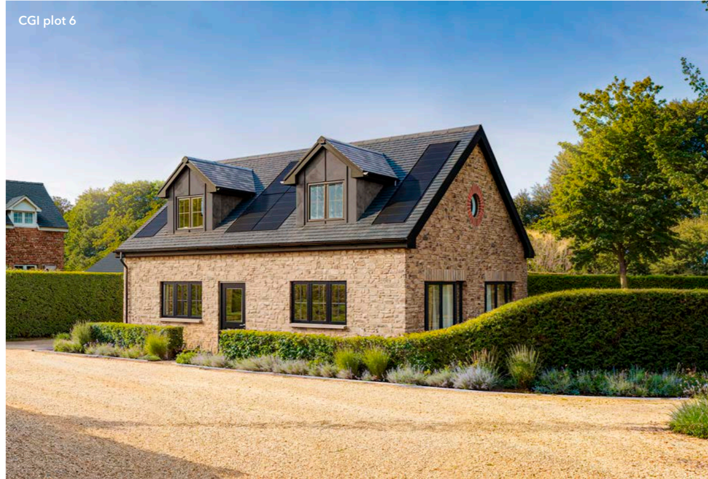
CGI plot 6