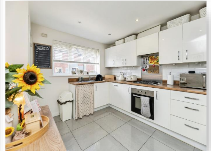
Throstle Road, Leeds LS10 4HH