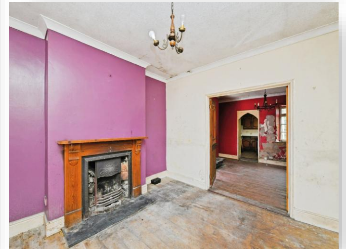
Merafield Road, Plympton PL7 1TL