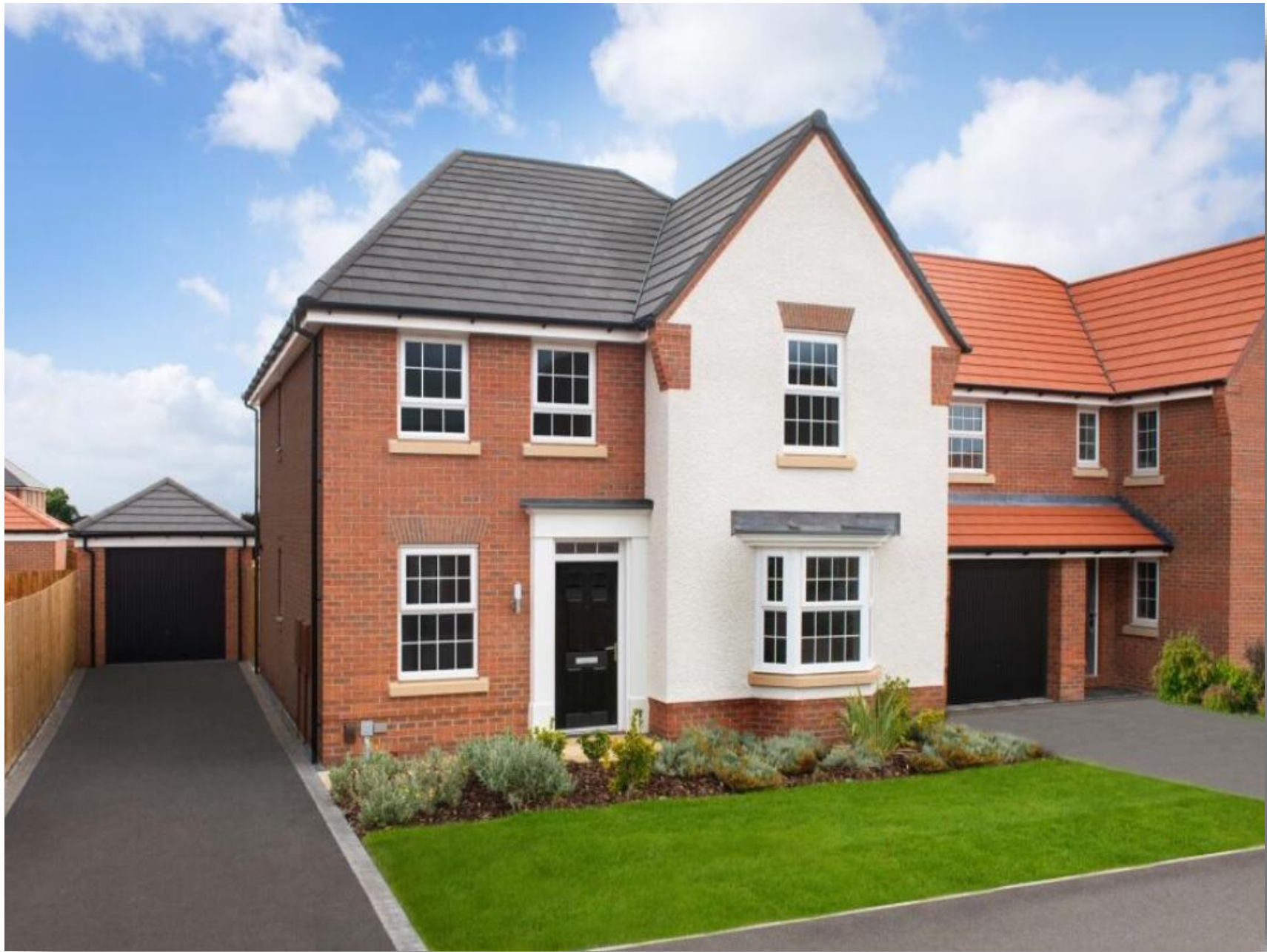
Chapel Lane, Bingham Nottingham NG13 7BS