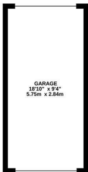
GARAGE 176 sq.ft. (16.3 sq.m.) approx.