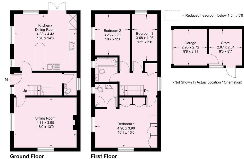
illustration for identification purposes only. measurements are approximate, not to scale Pursuant to RICS Property Measurement 2nd Edition © Intelligent Property Marketing 2026