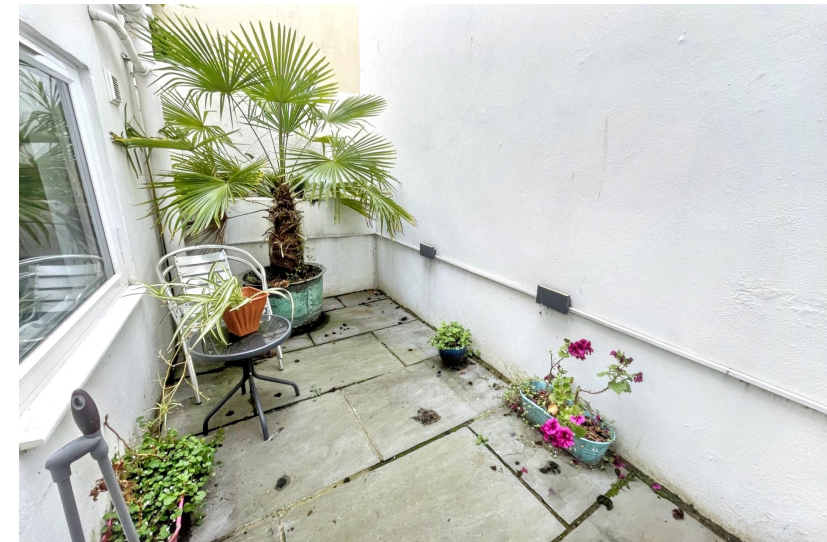
Lower Ground Floor Approx 11 sq m / 123 sq ft