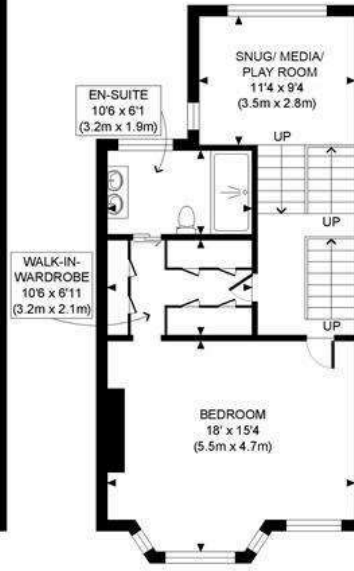
FIRST FLOOR GROSS INTERNAL FLOOR AREA 612 SQ FT