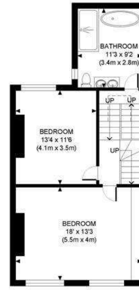
SECOND FLOOR GROSS INTERNAL FLOOR AREA 593 SQ FT

APPROX. GROSS INTERNAL FLOOR AREA: 2630 SQ FT/ 244 SQM (INCL LIMITED STORAGE)