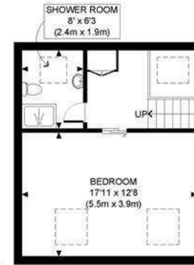
THIRD FLOOR GROSS INTERNAL FLOOR AREA 378 SQ FT