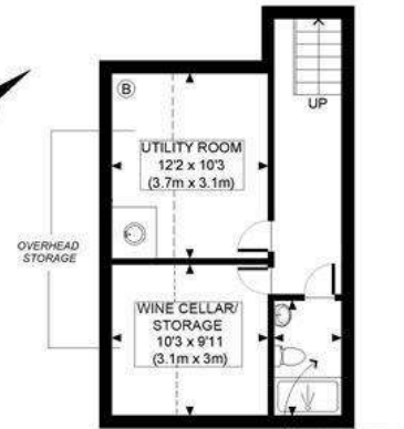
LOWER GROUND FLOOR GROSS INTERNAL FLOOR AREA 355 SQ FT