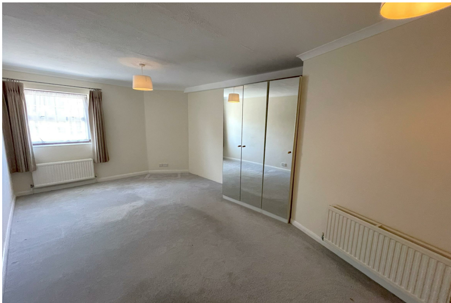
1 Place Court, Place Road, Fowey, Cornwall, PL23 1BQ