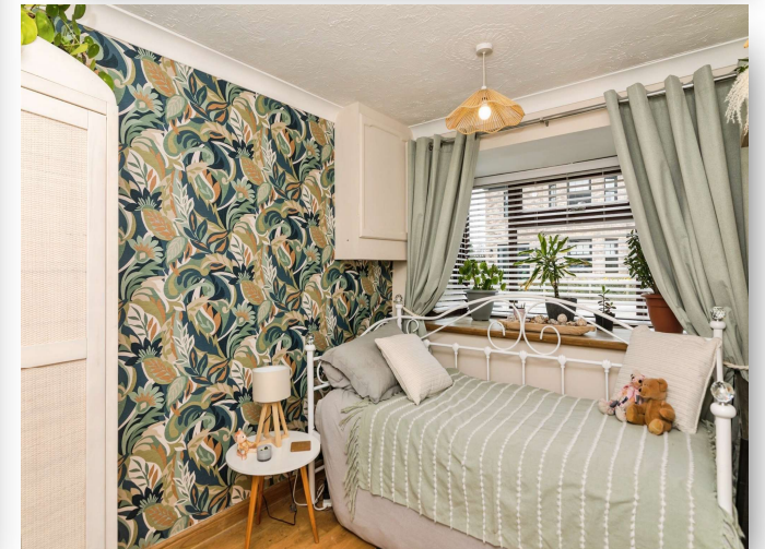
Century On Green Lane, Kessingland Lowestoft NR33 7RH