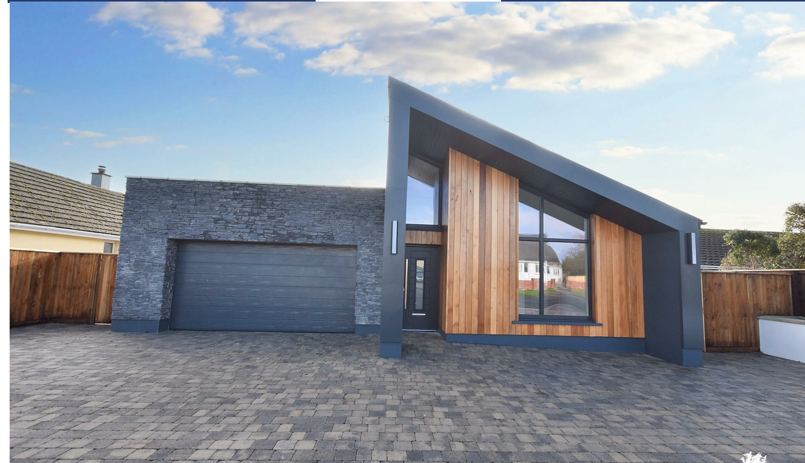
"34 Church Road", Roch, Haverfordwest, Pembrokeshire, SA62 6BG

WE WOULD LIKE TO POINT OUT THAT OUR PHOTOGRAPHS ARE TAKEN WITH A DIGITAL CAMERA WITH A WIDE ANGLE LENS. These particulars have been prepared in all good faith to give a fair overall view of the property. If there is any point which is of specific importance to you, please check with us first, particularly if travelling some distance to view the property. We would like to point out that the following items are excluded from the sale of the property: Fitted carpets, curtains and blinds, curtain rods and poles, light fittings, sheds, greenhouses - unless specifically specified in the sales particulars. Nothing in these particulars shall be deemed to be a statement that the property is in good structural condition or otherwise. Services, appliances and equipment referred to in the sales details have not been tested, and no warranty can therefore be given. Purchasers should satisfy themselves on such matters prior to purchase. Any areas, measurements or distances are given as a guide only and are not precise. Room sizes should not be relied upon for carpets and furnishings.