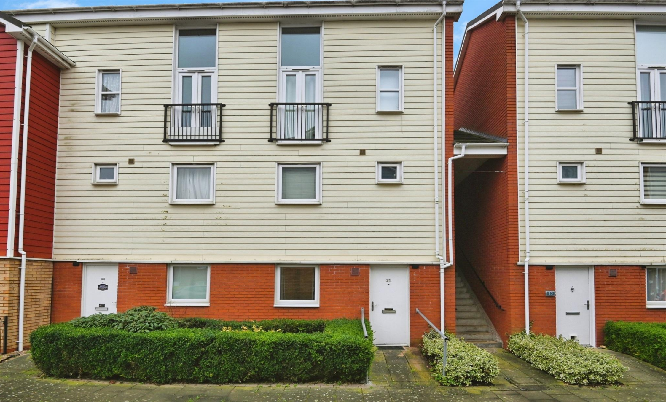
Merlin Walk, Birmingham B35 6QL

Not for marketing purposes INTERNAL USE ONLY