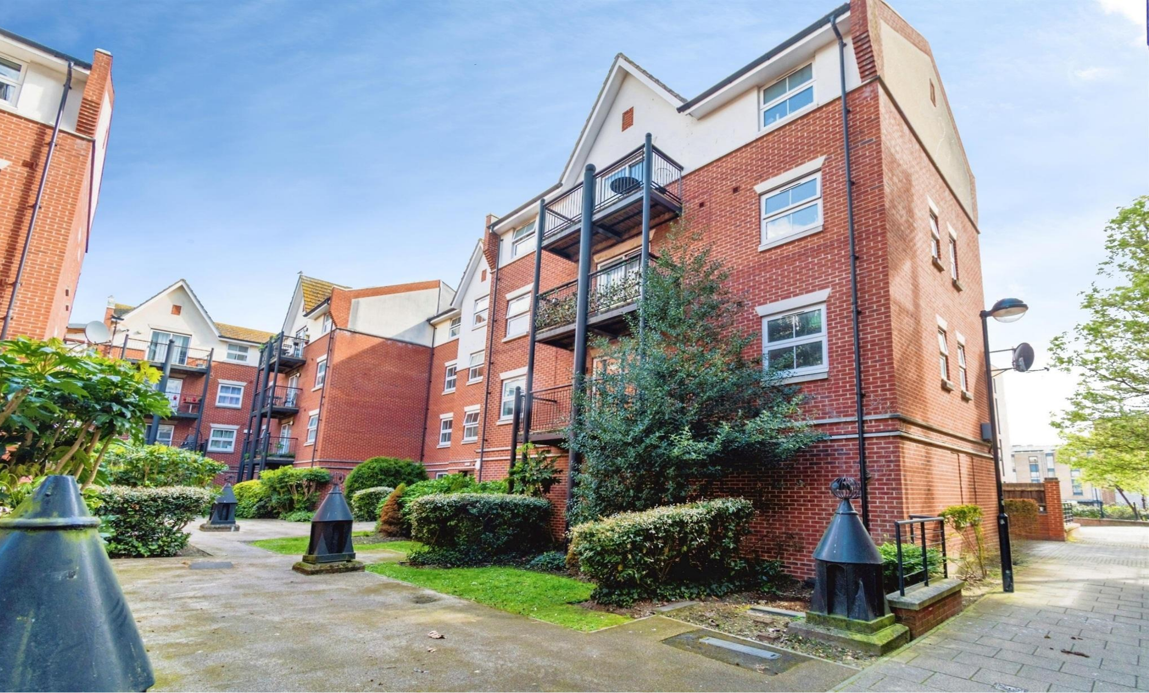
Chandlers Court, Briton Street, Southampton SO14 3EZ