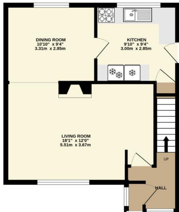
GROUND FLOOR 599 sq.ft. (55.7 sq.m.) approx.