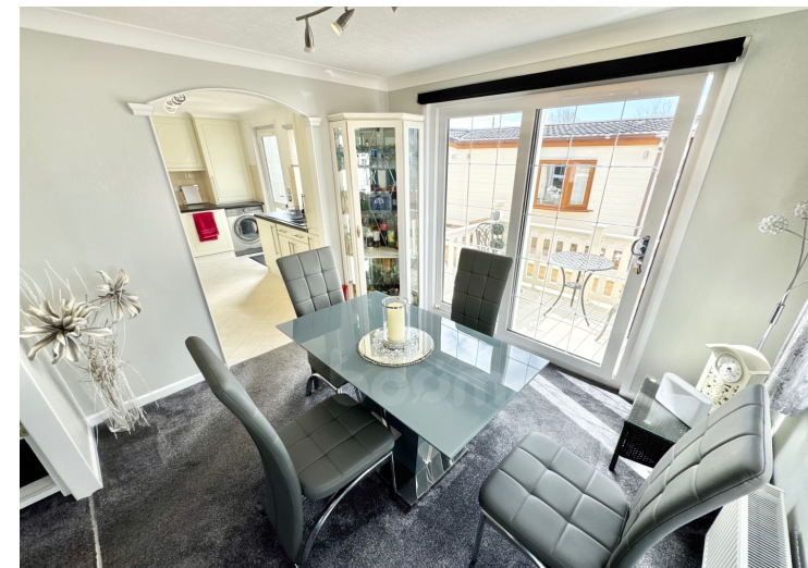
Willow Park, Lochlibo Road, Burnhouse, Beith