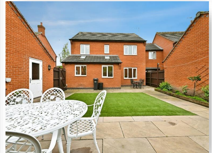
Howard Drive, Kegworth