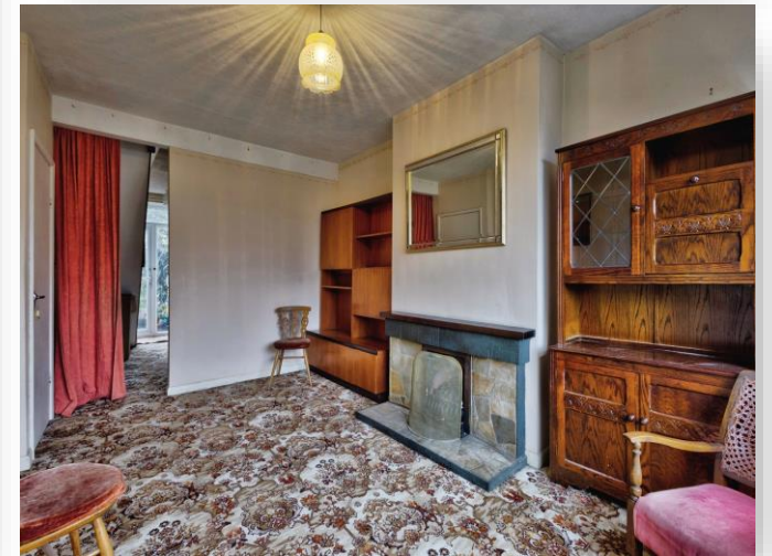
Washbrook Close, Little Billing, Northampton NN3 9AP