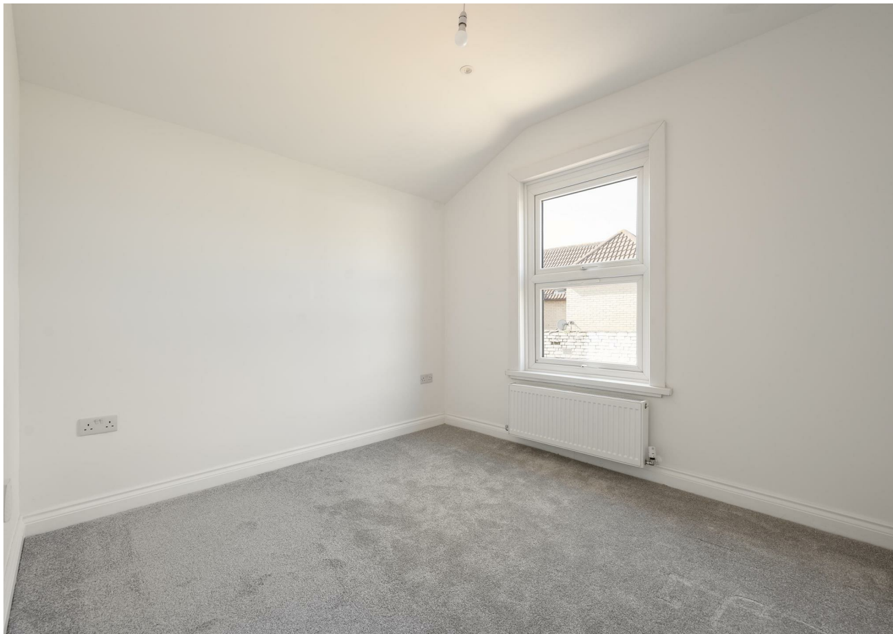
Reception 10'1" x 12'4"