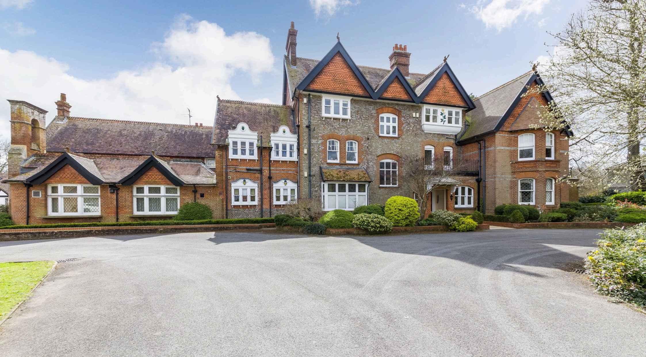
Riverside House, Burcot, OX14