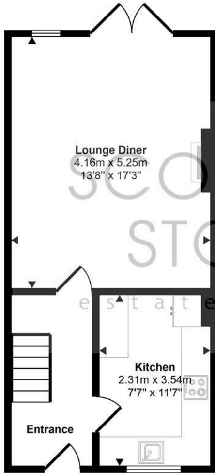
Ground Floor Approx 37 sq m / 401 sq ft

Approx Gross Internal Area 75 sq m / 805 sq ft