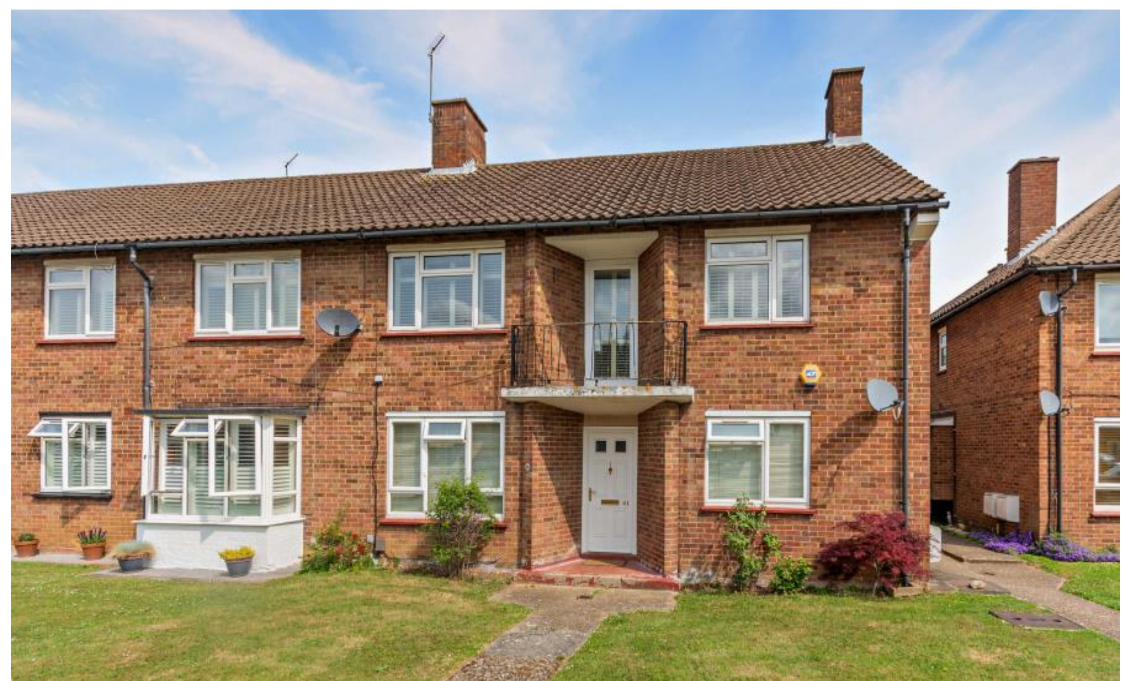
A well presented two bedroom maisonette with private garden Ellement Close ,Pinner , HA5 1EP