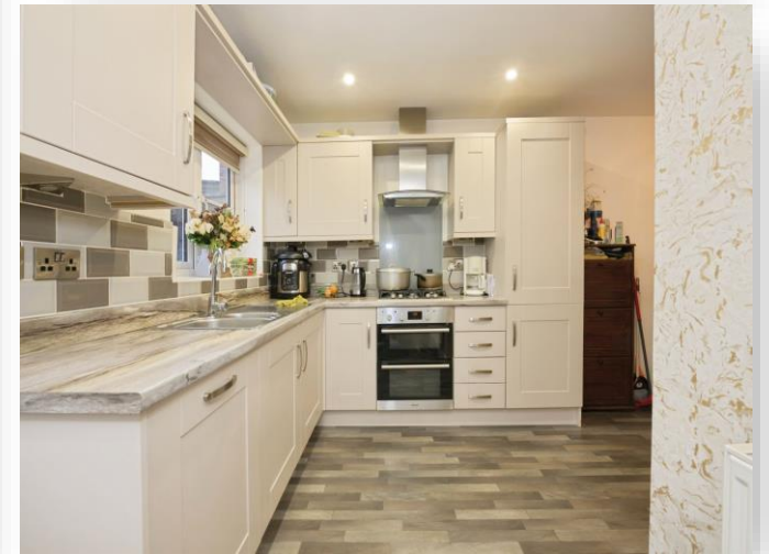
Whitmore Street, Whittlesey Peterborough PE7 1HQ