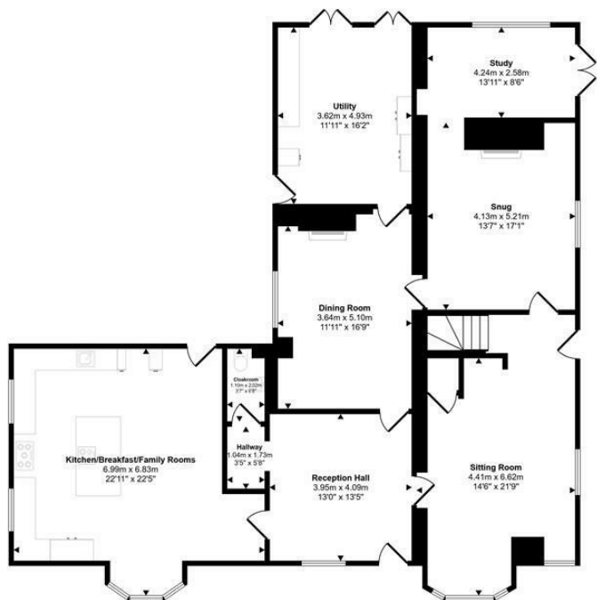
Ground Floor Approx 171 sq m / 1839 sq ft

Approx Gross Internal Area 386 sq m / 4176 sq ft