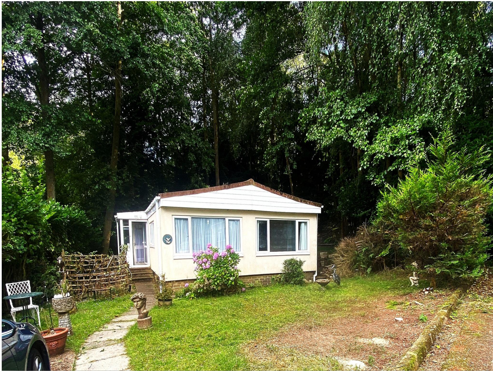
Woodpecker Way, Turners Hill Park, Turners Hill Crawley RH10 4TY