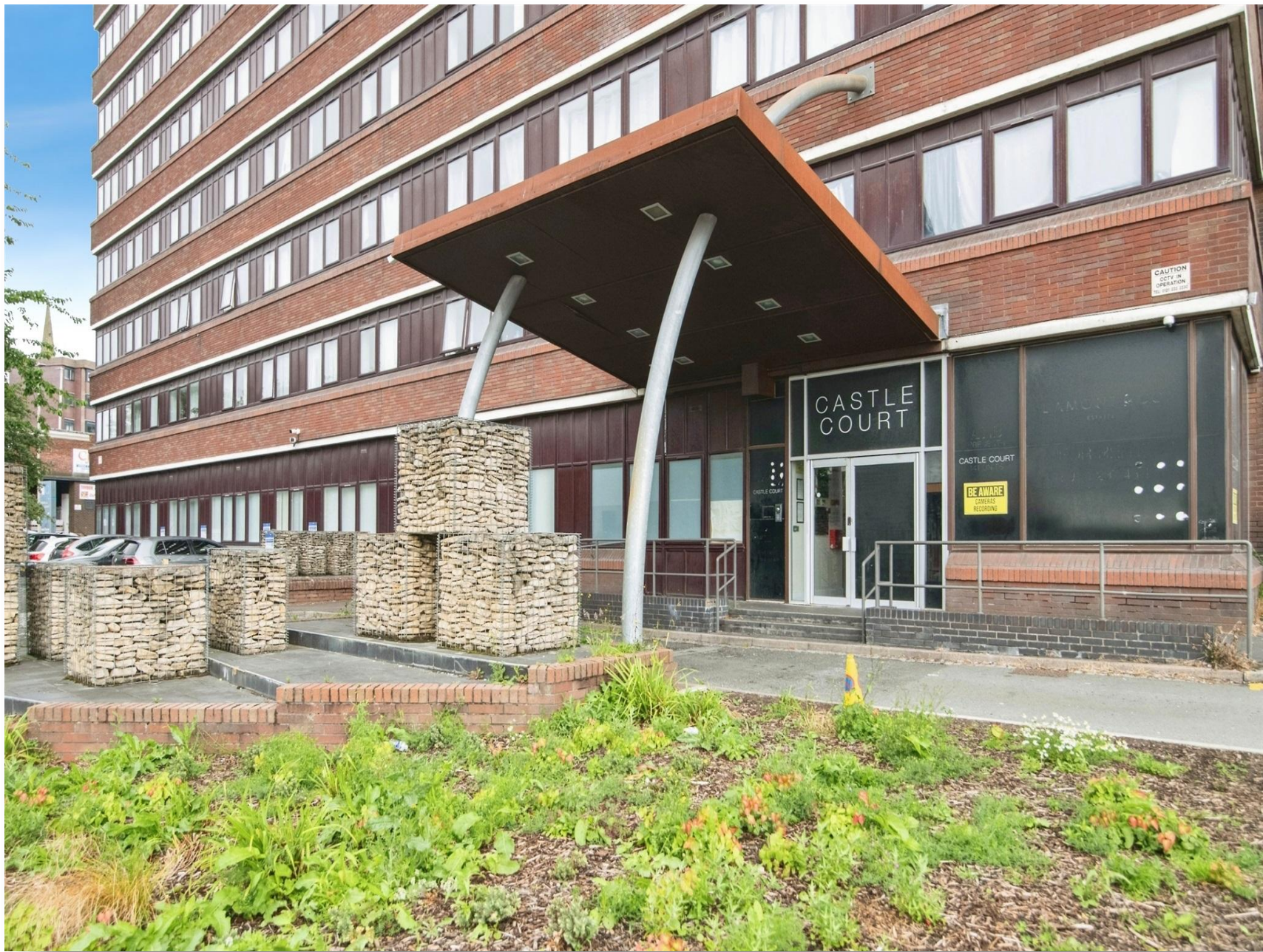
Castle Court The Minories, DUDLEY DY2 8PG