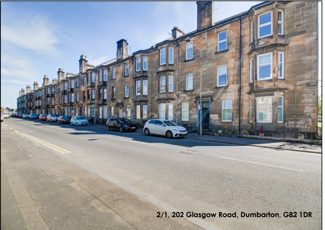
2/1, 202 Glasgow Road, Dumbarton, G82 1DR

Occupying a commanding top-floor position within an elegant traditional tenement, this exceptional two-bedroom apartment presented to the market by David Muir Estate Agents offers a rare opportunity to acquire a home of genuine character and distinction in one of the East End's most sought-after residential pockets.