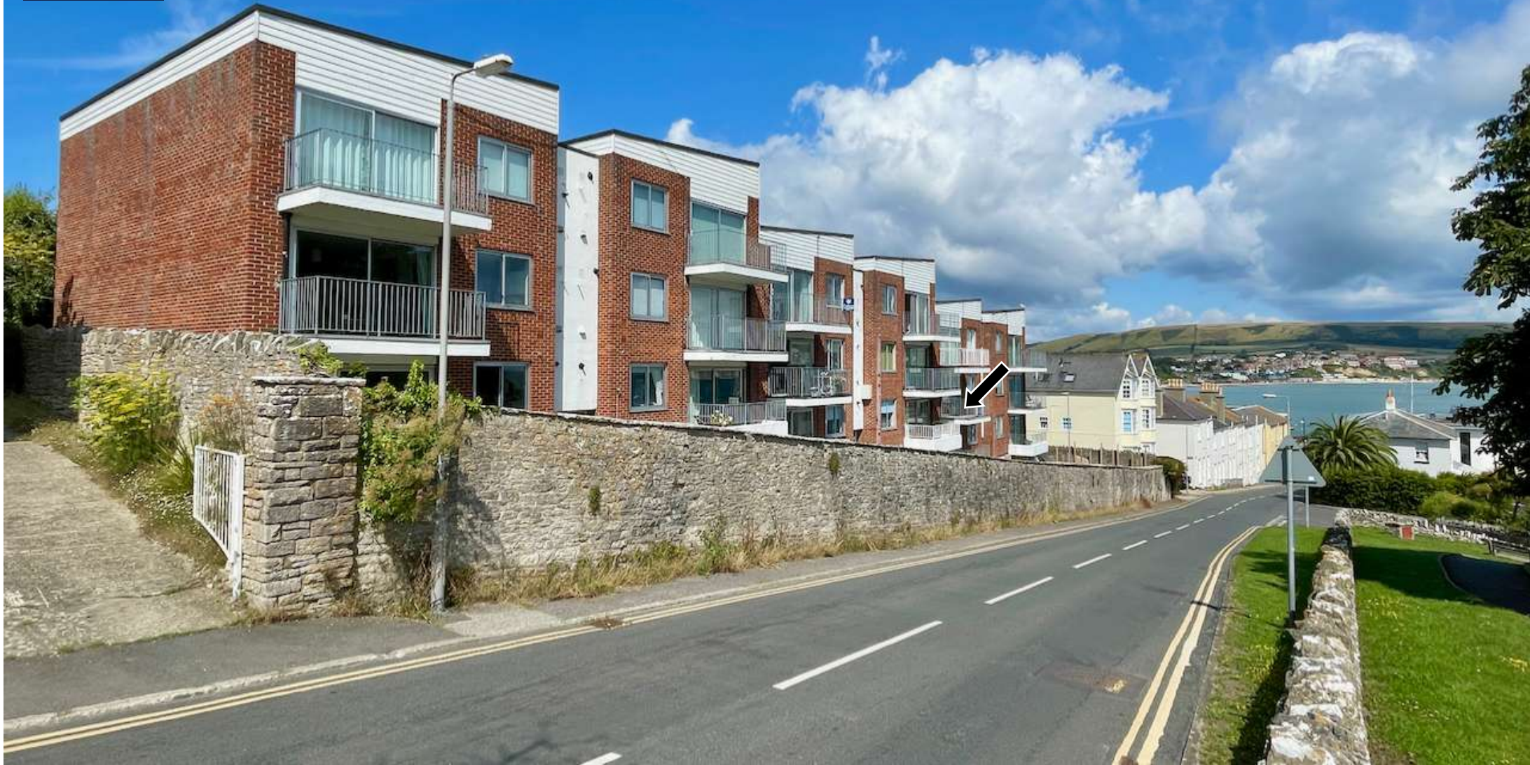
18 PEVERIL HEIGHTS, SENTRY ROAD, SWANAGE £325,000 Shared Freehold