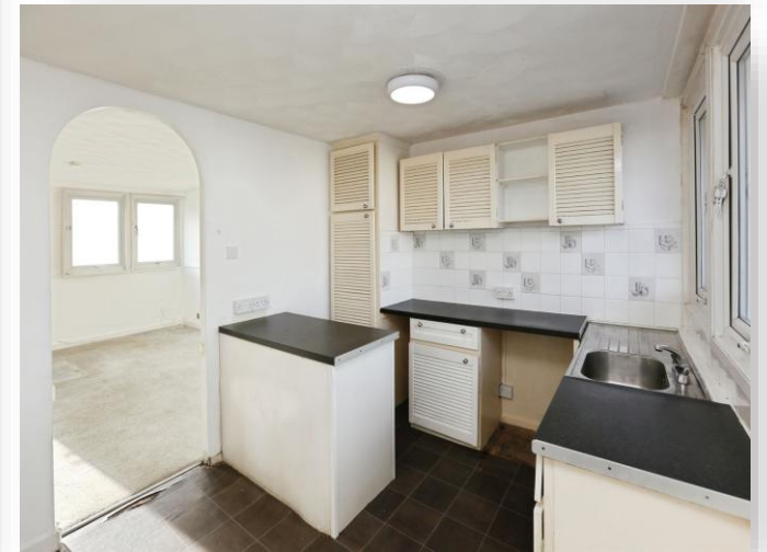
Mantle Close, Gosport, PO13 9QT